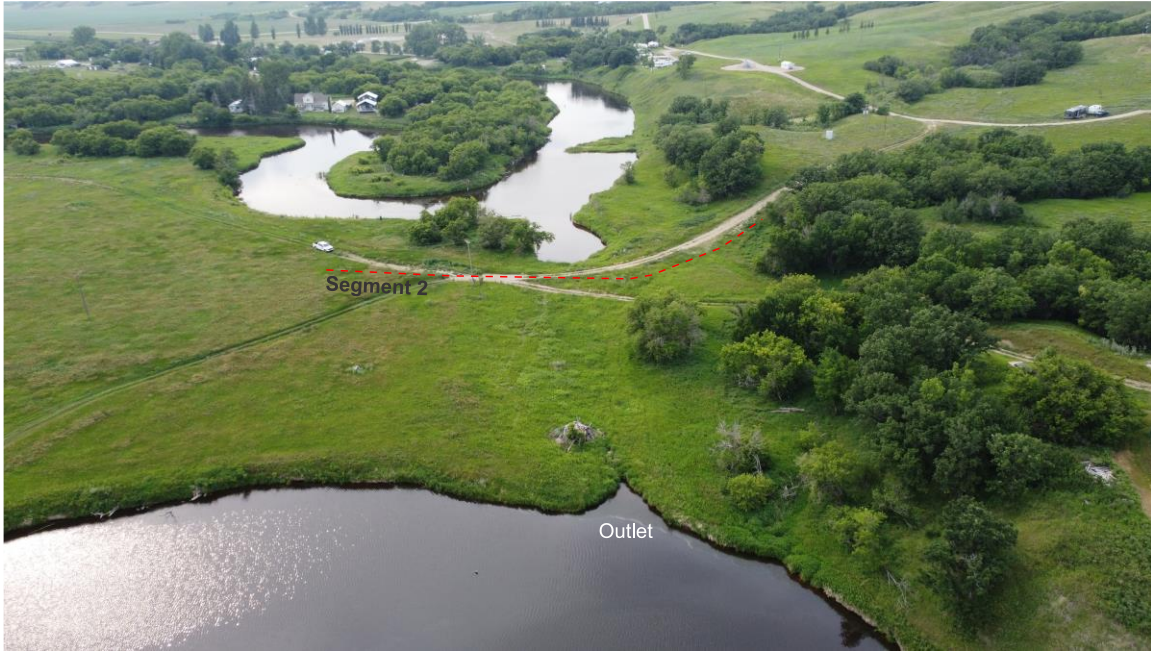
Figure A3 Aerial oblique photo showing flowline segment 2 and surroundings (14 Jul 2021). View northwest