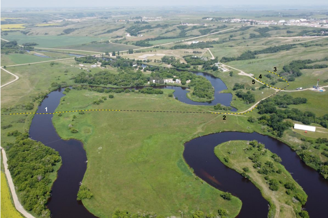
Figure A1 Aerial oblique photo showing overview of numbered flowline segments (14 Jul 2021). View northwest