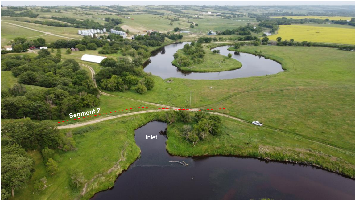
Figure A4 Aerial oblique photo showing flowline segment 2 and surroundings (14 Jul 2021). View southeast