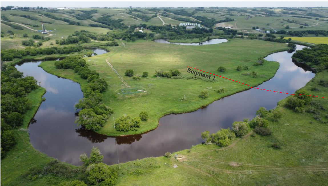
Figure A2 Aerial oblique photo showing river reach surrounding segment 1 (14 Jul 2021). View east-northeast