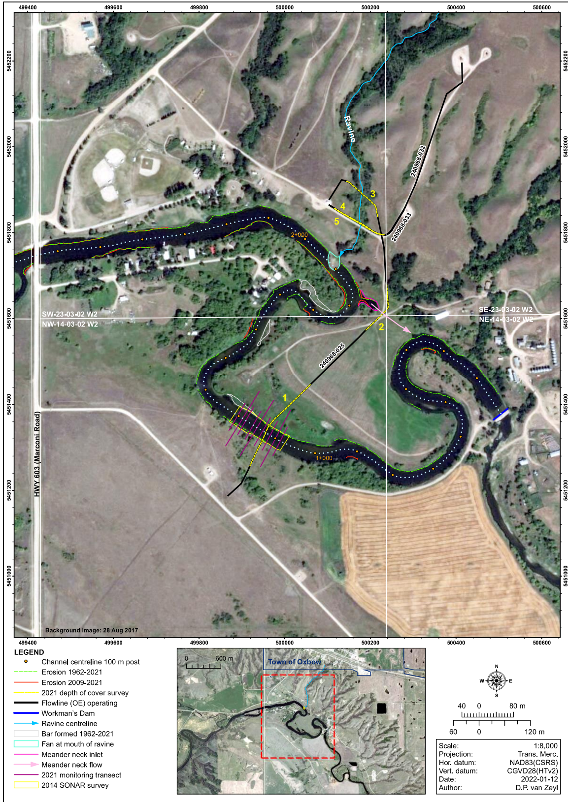
Figure 1 Overview August 2017 satellite image map.